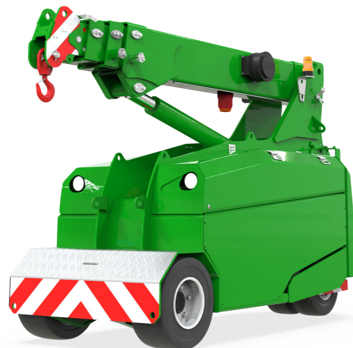
MC 32S (metric) Max Capacity 3,200 Kg